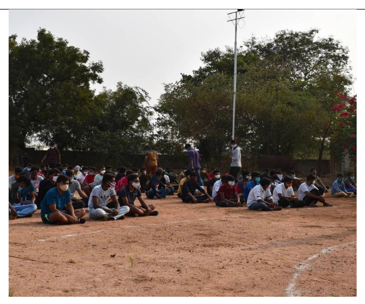
Enrollment of new cadets into NCC