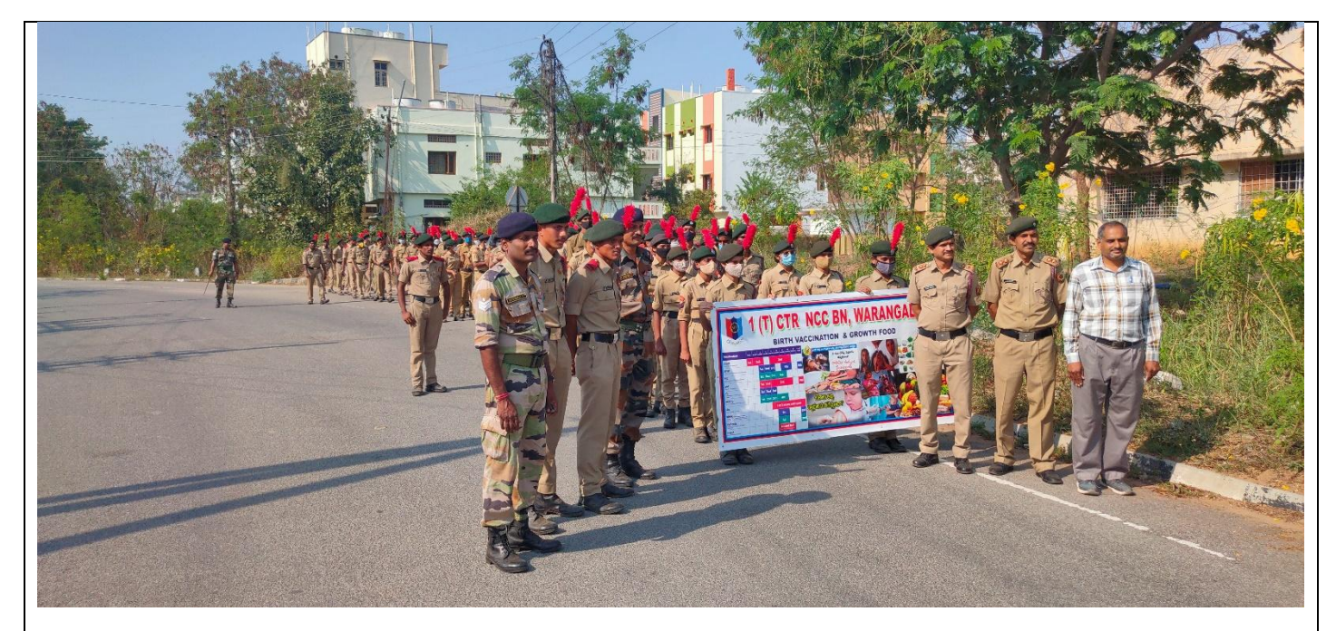
Rally on Birth Vaccination