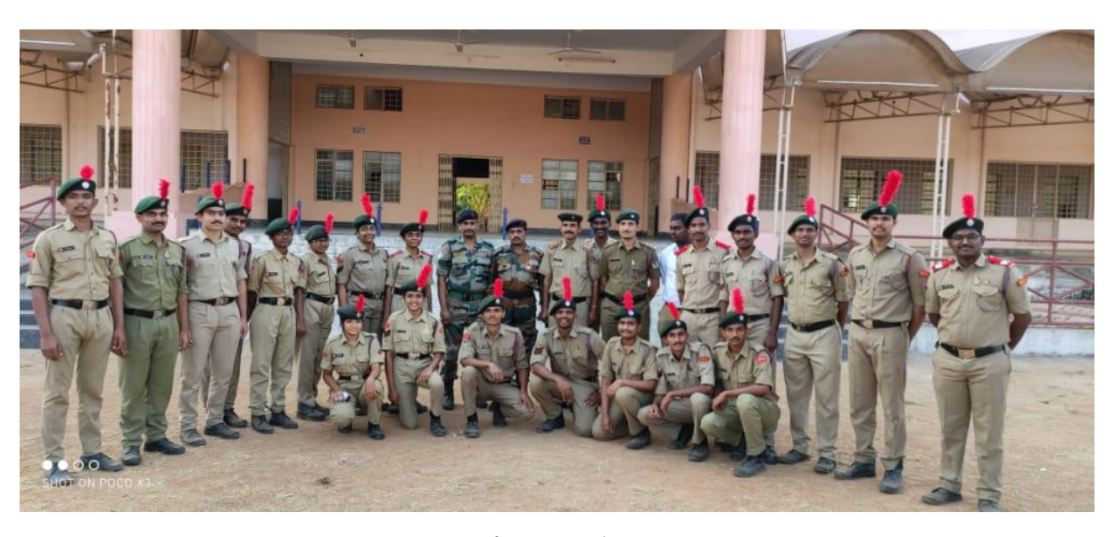
C certificate cadre camp