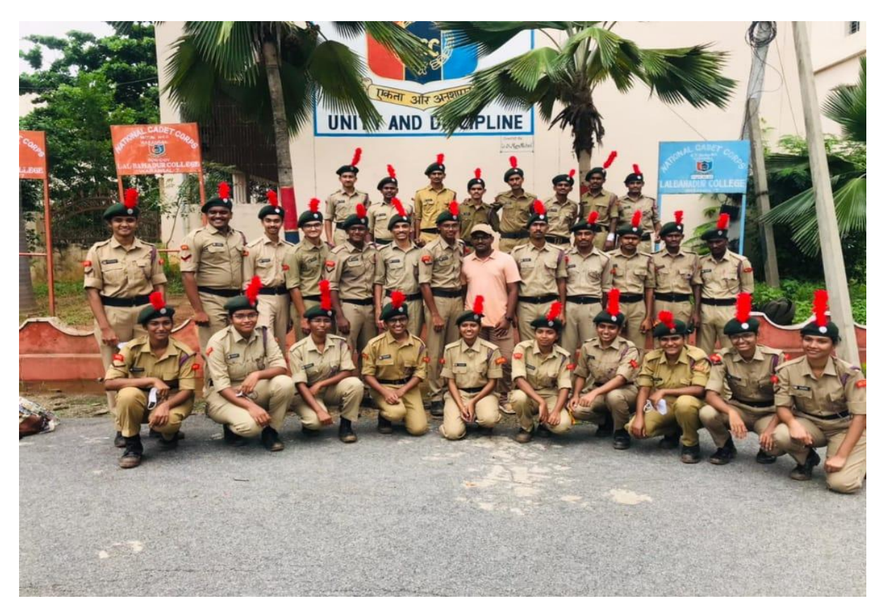
B certificate exam completion