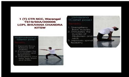
International Yoga day