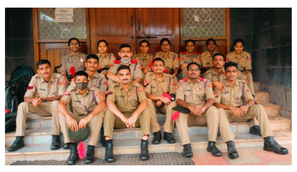
C certificate exam completion