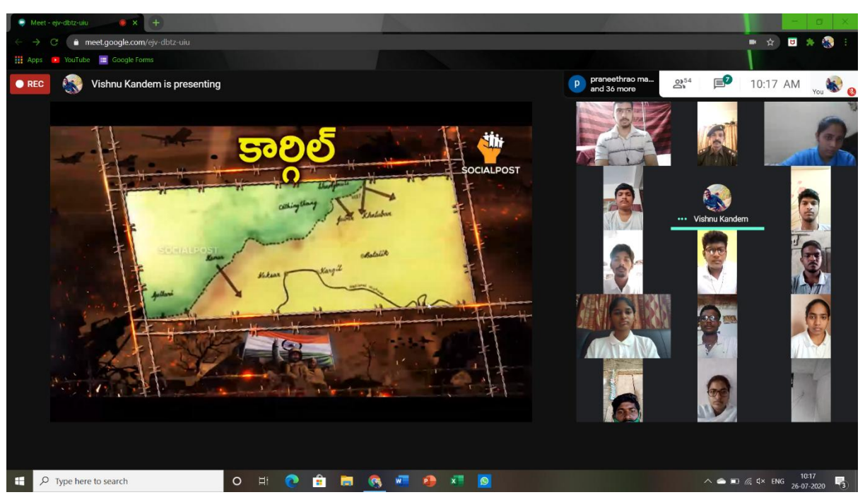
Kargil Vijay Diwas