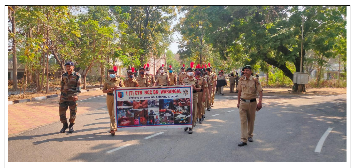
Rally on Effects of Smoking, drinking and drugs