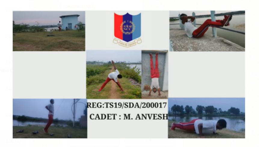
Fit India Campaign by cadets

Aatma Nirbhar Bharath awareness campaign by cadets through social media Sample certificate of a cadet