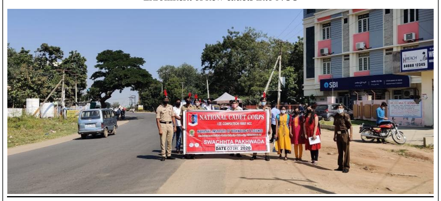
Awareness rally on ODF