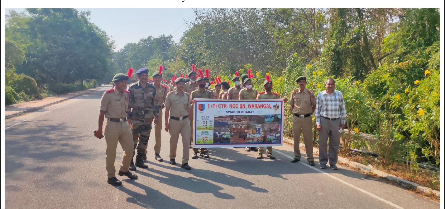
Rally on Swachh Bharath