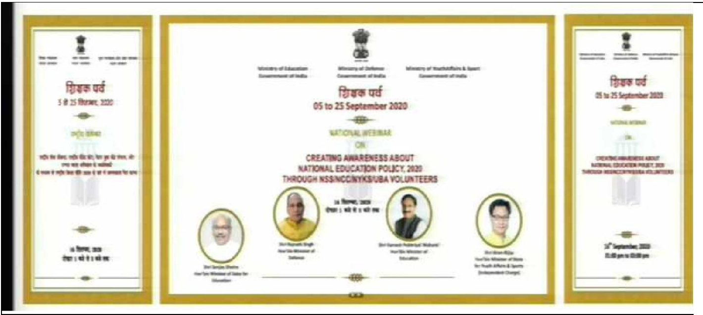
Webinar on National Youth Education Policy - 2020