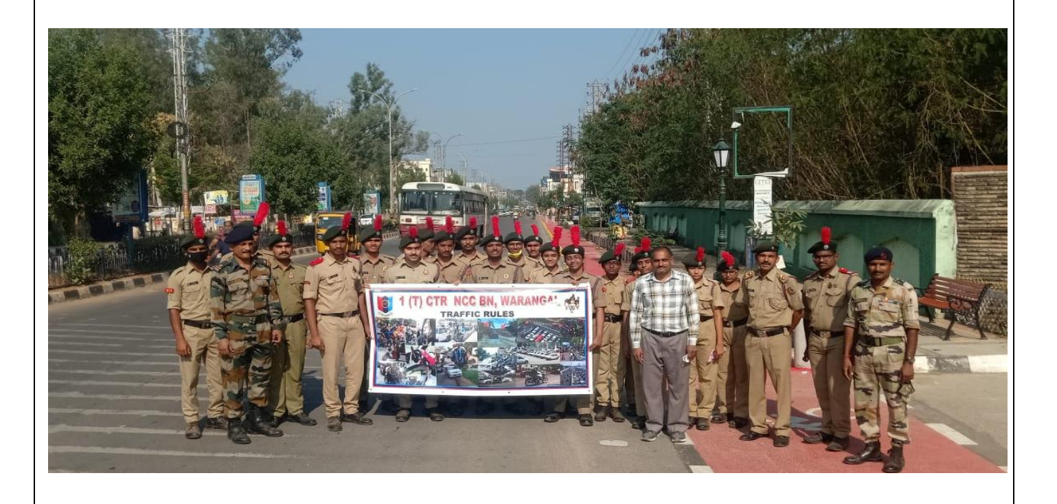
Rally on Traffic rules