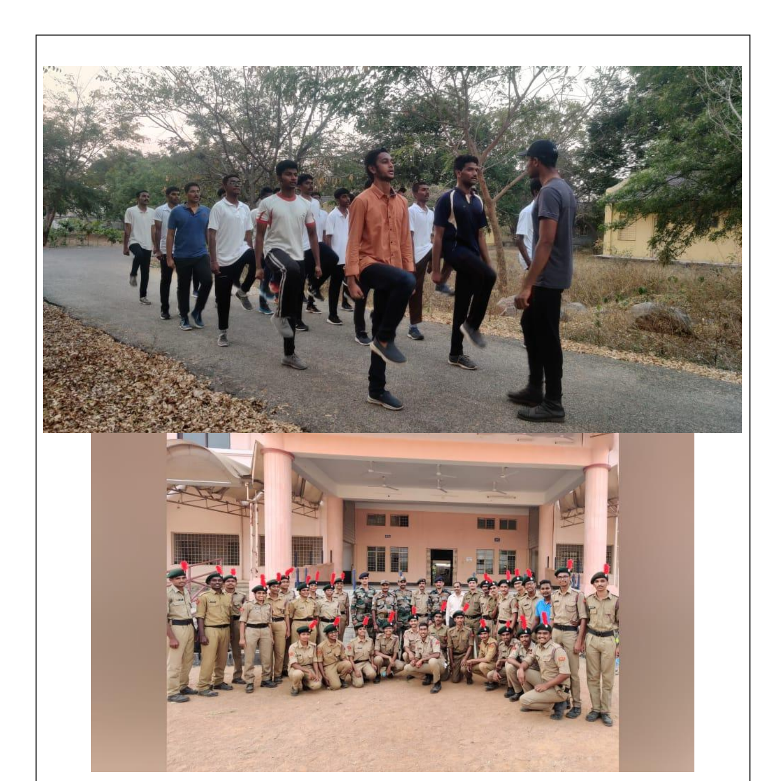
B certificate cadre camp