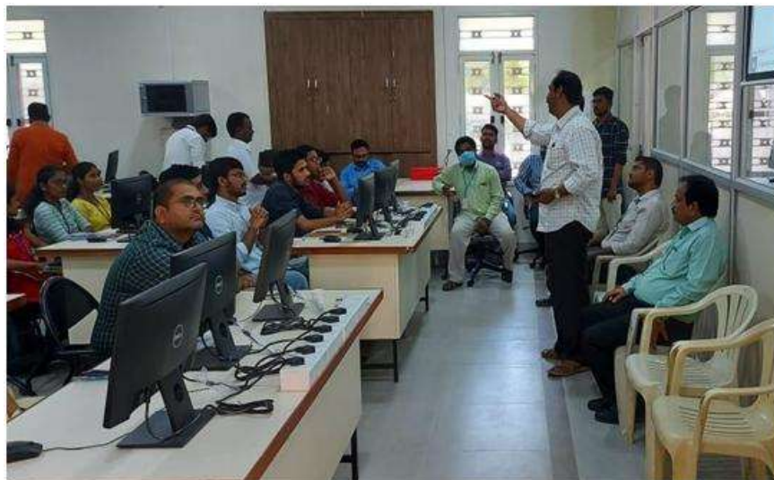
A workshop on Code Arduino - 2022