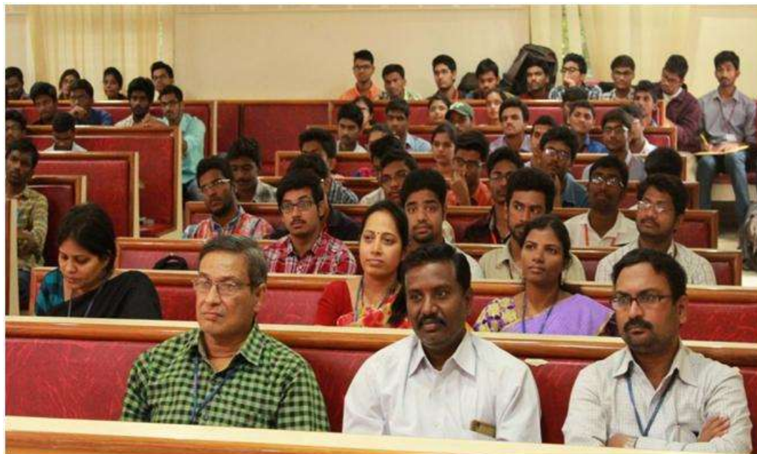
Inaugural session Techbuzz - a technical quiz, Circuitrix on 23rd January, 2016