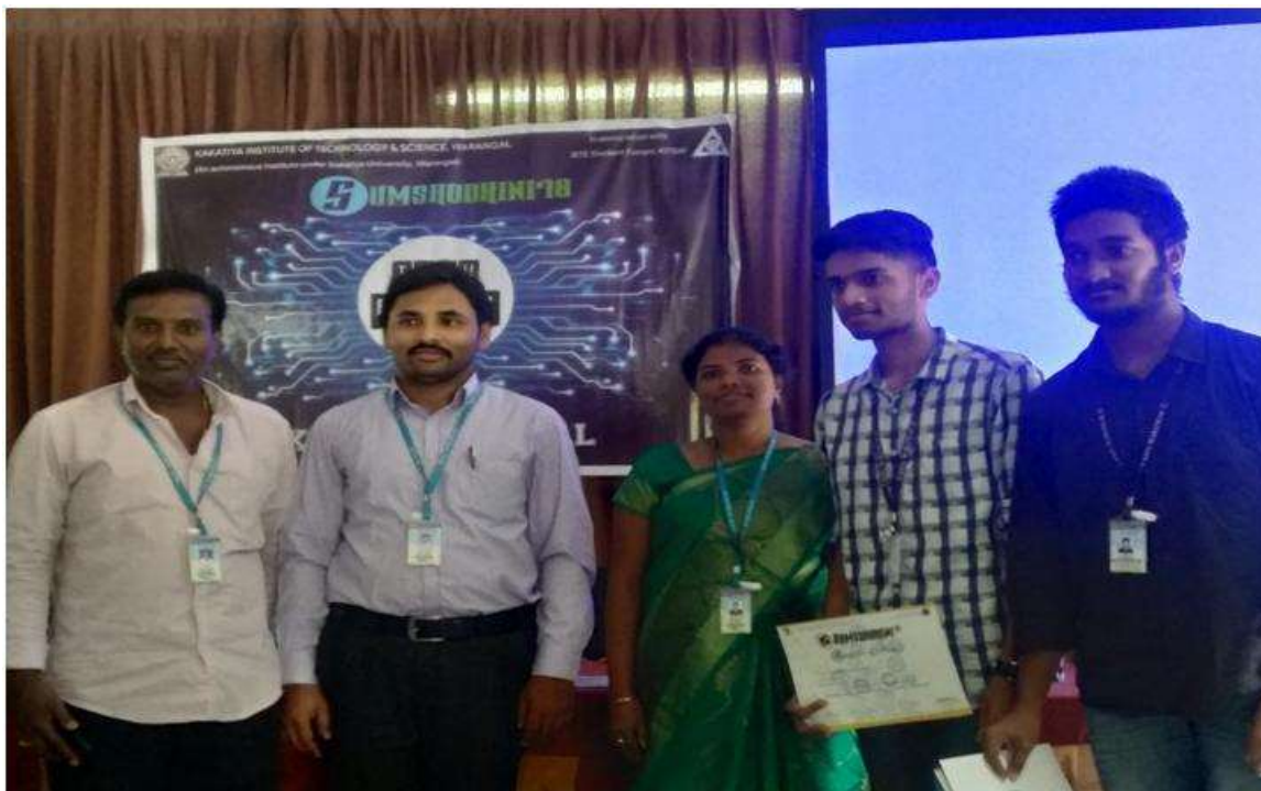
Techbuzz - a technical quiz conducted on 6th Oct, 2018