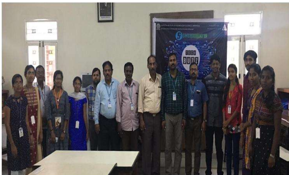
Techbuzz - a technical quiz conducted on 26th Oct, 2019