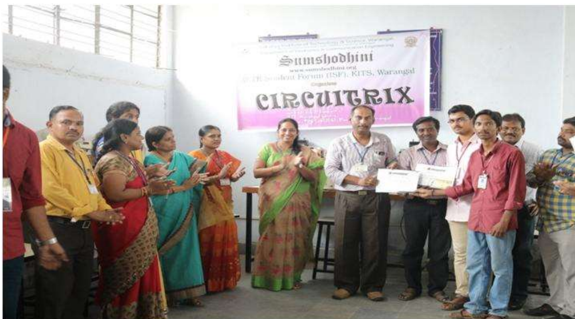
Circuitrix conducted on 12th Oct ,2017